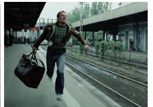
Top from left: The Saragossa Manuscript , A Short Film About Killing , Ashes and Diamonds , Camouflage Bottom: Jump , The Hourglass Sanatorium , Man of Iron , Blind Chance